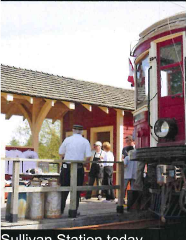
Sullivan Station today

The Fraser Valley Line is still intact and SRY Raillink provides freight service to its customers along this historic rail corridor.