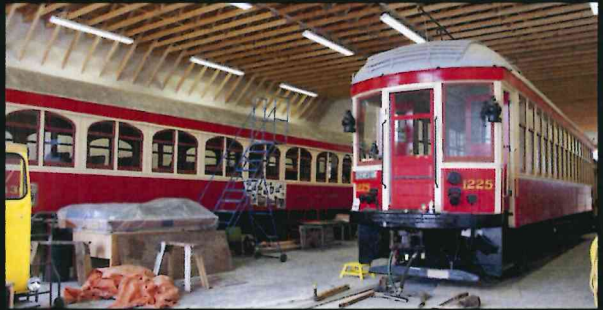
Cars 1304 and 1225 in the Cloverdale car barn

Conceived in 1996 as a special project by the Surrey Heritage Advisory Commission and following a 4-year feasibility study, the Fraser Valley Heritage Railway Society was formed to acquire, restore and operate the two remaining interurban cars BCER 1225 and 1304 on the original route through Surrey. Now it will again be possible to experience a part of Surrey's transportation history by riding the scrupulously restored BCER 1225 between Cloverdale and Sullivan. The route will expand west to Newton, Kennedy and Scott Road incrementally over the following years when both 1225 and 1304 are operating at the same time. BCER 1304 known as the "Connaught" and the only Chilliwack car to survive, is under restoration and should be operational by 2017.