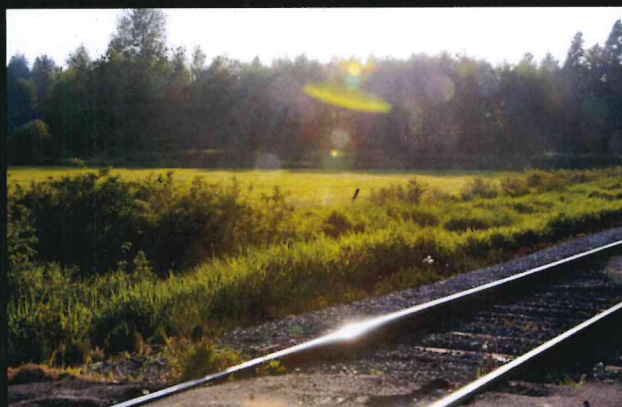
Approaching Sullivan at 168th St crossing