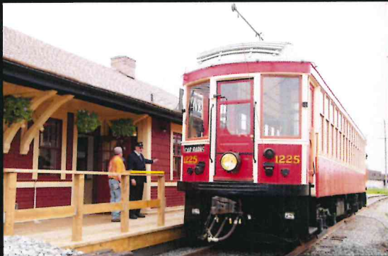
1225 standing at Cloverdale Station

There are 19 spaces to the east of the Station as well as street parking on 176th and 176A.