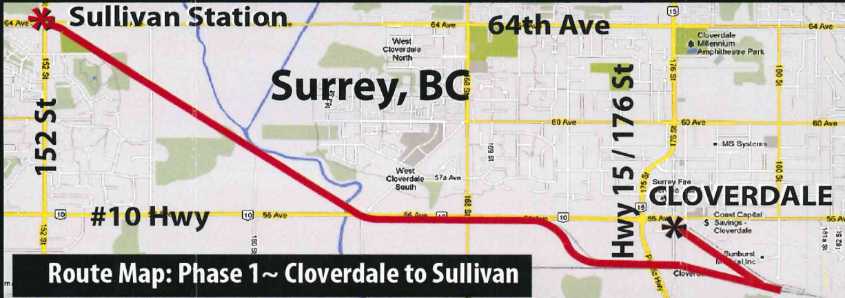
Route Map: Phase 1~ Cloverdale to Sullivan